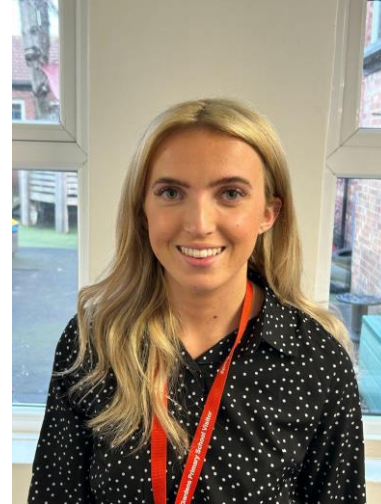
Class 10 Miss